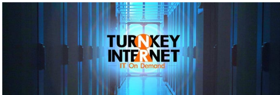
TurnKey's on-premises infrastructure solutions allow for direct management of mission-critical assets.

"From day one, we built the company around owning, controlling, and maintaining every piece of our infrastructure," he said. "This helps us ensure quality and pricing to gain a competitive edge in the market."